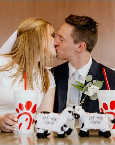
They met at Chick Fil A