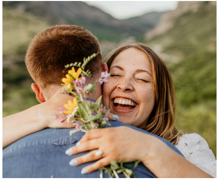
Bring some flowers