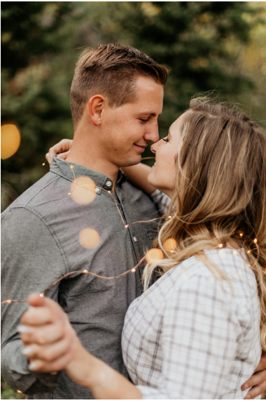
Add some fairy lights