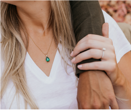
A family heirloom