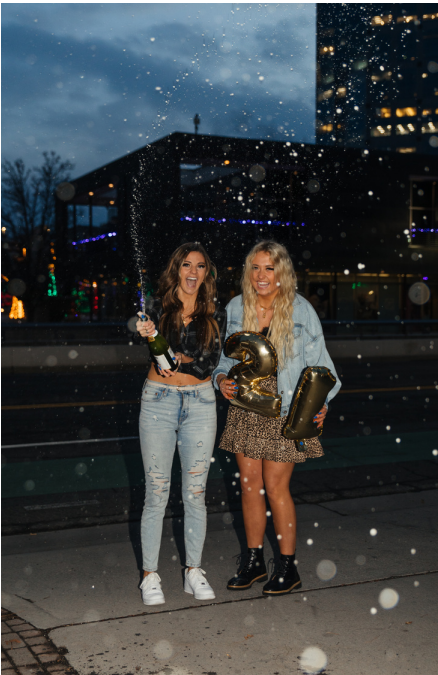
Shake up somethin' fizzy