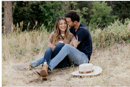
Hats/beanies are ALWAYS a win

TOTALLY you! If you want to keep it simple, hats, blankets or matching sweatshirts are totally awesome and make for some great pics! But if you want to make it even more personal, I am HERE FOR IT! If you guys are super into Harry Potter, maybe bring your wands you got from Diagon alley and we can shoot a couple pics like you're having a duel! If you guys have a fur baby together, PLEASE bring your pupper! If you love the bachelor and watch it together every Monday (or Tuesday for us Hulu-er's) then heck bring a long stemmed red rose! Or if you met because your dream boat showed up at your door with a box of pizza from your favorite pizzeria, LET'S GET SOME PIZZA IN THESE PICS! Props are a fun way to tell your story! They don't have to be in every shot and we can take some without them, but make your session totally unique and your own by bringin things that mean something to you! Here are some cool things that I've seen!