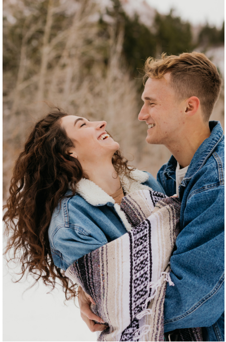
Bring a blanket