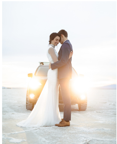
Show off your sick ride