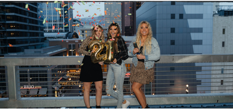
Pop the confetti