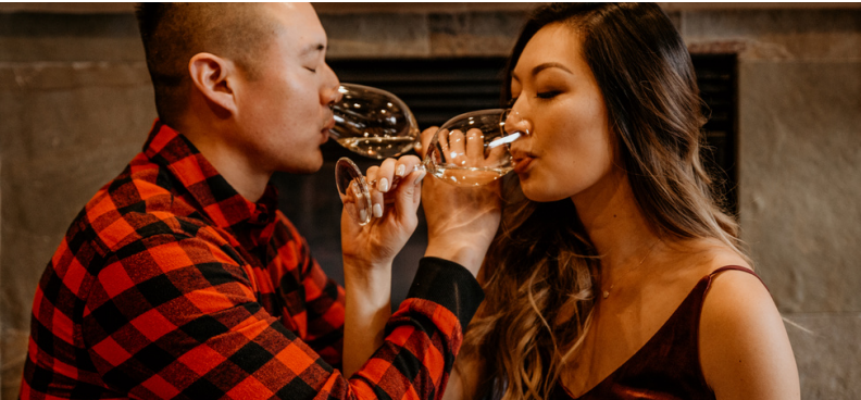
Add in your fave drink